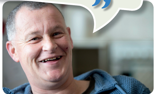
Image used for illustrative purposes person shown is not an EG foodbank client

“ I felt ashamed of my situation, that I had failed my son and found it so difficult to ask for help. I arrived at the JCC with my head hung in shame. I was met at the door by a warm smiling face, treated with the utmost respect & reassured that I was not alone'. I felt humbled by the generosity of local people & the volunteers who helped me. ”